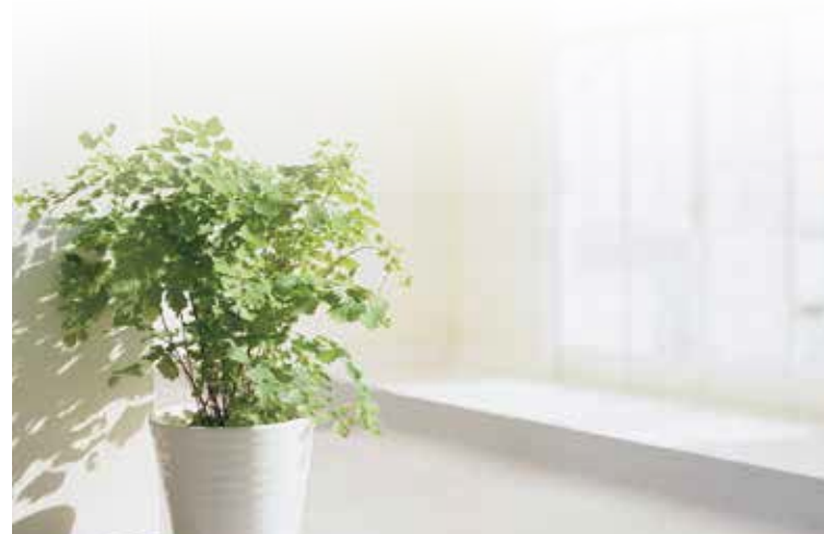
Brain Health Assessment

如家族有中風病史，宜盡早識別本身的中風風險，並作針對性預防，以避免因中風所致的不可逆轉的傷害。