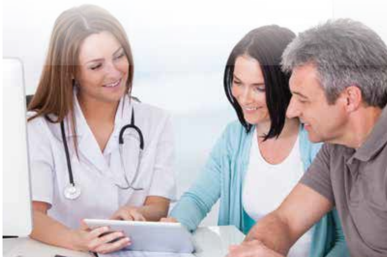
Brain Health Assessment

為協助大眾防範於未然，香港港安醫院—司徒拔道提供全面的腦部健康檢查服務，由專科醫生採用先進的醫學科技，為您評估腦部和腦血管的健康狀況。