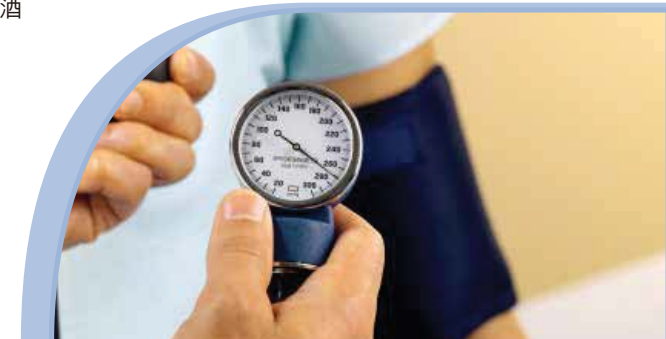
Brain Health Assessment